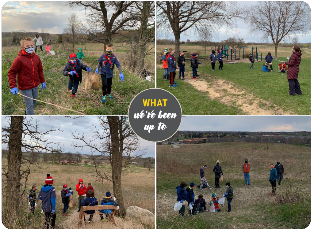
Above: Our April Pack Meeting was a successful service project at Badger Prairie Park. The Scouts picked up litter they found on the prairie and got some exercise as well.