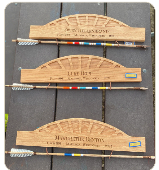
Above: The beautiful handmade arrows presented to our three Arrow of Light scouts.

Friday, June 4, 5:30 pm: Pack Picnic. More details to come.