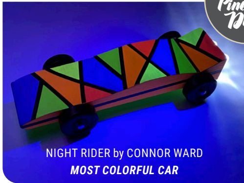
NIGHT RIDER by CONNOR WARD MOST COLORFUL CAR