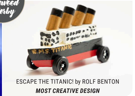
ESCAPE THE TITANIC! by ROLF BENTON MOST CREATIVE DESIGN